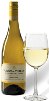
Sonoma Cutrer Chardonnay