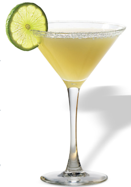
Patrón Margarita Reál