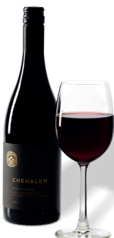
Chehalem Pinot Noir