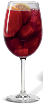
Legal Red Sangria