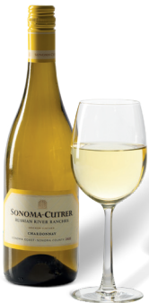
Sonoma Cutrer Chardonnay