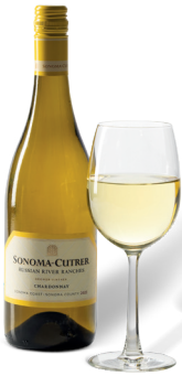
Sonoma Cutrer Chardonnay