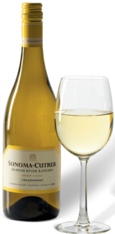
Sonoma Cutrer Chardonnay