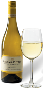
Sonoma Cutrer Chardonnay