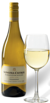
Sonoma Cutrer Chardonnay