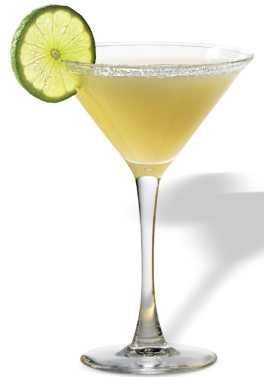
Patrón Margarita Reál