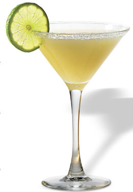
Patrón Margarita Reál